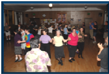
First Friday Irish Music & Dance Céilí Mór November 4